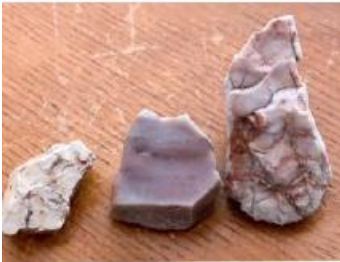
Assortment of colored chert