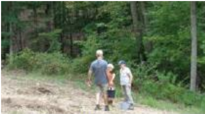
A Junior Rockhound showing his grandparents the jasper he found