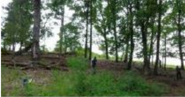
Hillside collecting near a small stream that ran across the ranch